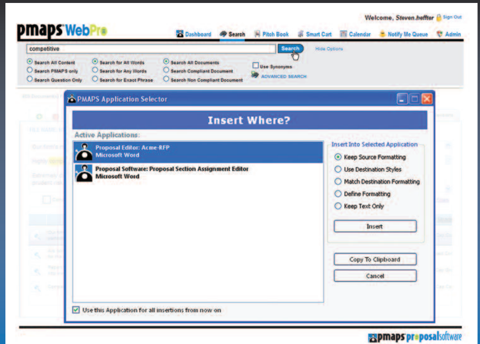
WEBPRO VIEWER APPLLET

PMAPS® proposal solutions have always offered “single-click” insertion from database to RFP or proposal document. PMAPS® WebPro is no different. It comes with a unique tool that allows users to automatically insert a response without the need to cut and paste. Once a search has been completed and the appropriate content found, a single click places the fully formatted content into the proposal or marketing document being created. Fast, simple and convenient ... PMAPS® WebPro.