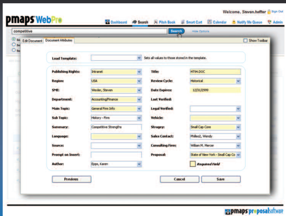
WEBPRO DOCUMENT ATTRIBUTES